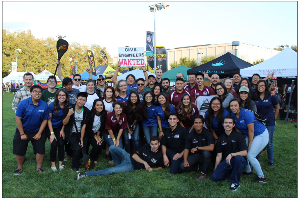
CPP ASCE Club Officers at the CPP Club Fair during the beginning of Fall Quarter.

**any location change will be announced in advance