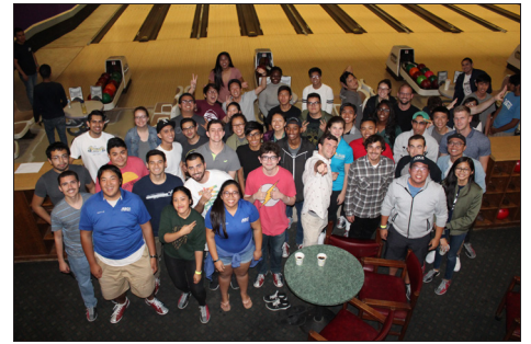
Everyone had a blast at the ASCE Bowling Night

Bowling Night strikes the Fall Quarter off with a BANG! Our CPP ASCE members enjoyed a fun night full of bowling on October 12th at Oak Tree Lanes, Diamond Bar. There were over 50 members in attendance as students quickly filled up the lanes. The environment provided a great opportunity for socializing with both new and returning members. This welcoming off-campus event allowed our members to meet new people, develop strong friendships and to stay active in the club. Thanks to our members, the CPP ASCE family grows bigger each year. We appreciate the support from everyone in view of the fact that made Bowling Night a special one.