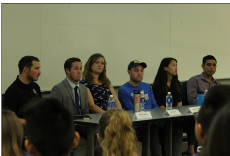
Students received valuable advice from the alumni panel

CPP ASCE hosted activities throughout one week in November in celebration of ASCE's 165th birthday! The goal of ASCE Week is to remind members about ASCE's impact on our campus, in the local community and the nation. In addition, we hope to build stronger relationships between the officers and members.