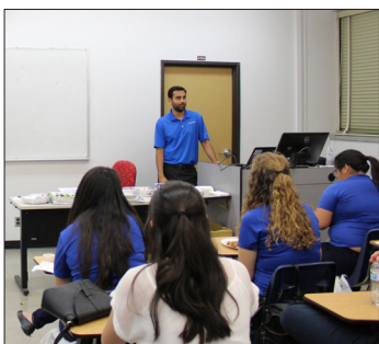
Students receiving career advice from Kimley-Horn

This quarter, CPP ASCE had a wonderful opportunity to work with both Kimley-Horn and Griffith Company to offer students information sessions. These info. sessions were aimed to both help their respective companies recruit and let students know about upcoming career opportunities, as well as allow students to ask their questions.