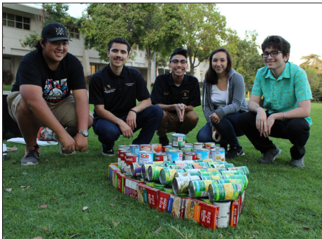
Canstruction was "easy as pie"