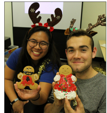
Cookie-decorating at the Mentorship Holiday Party

The CPP ASCE Mentorship Program aims to provide new and incoming students a more welcoming and smooth transition into civil engineering. The program's goal is to introduce these students to fellow classmates and upperclassmen to familiarize themselves with the CE department and ASCE. The program offers a network of students as a support system to guide mentees in classes, campus involvement, internships, or personal life. The relationships are built from the mentors and mentees' interactions with each other and through the socials that are held every quarter for all of the mentors and mentees. The programs from this past quarter entailed a social in the Bronco Student Center Game's Room, button making and trivia night, along with a Holiday Party!