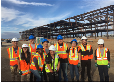
Members had the opportunity to learn about Turner's project at LAX

CPP ASCE attended a technical tour hosted by Turner Construction of the $1B Midfield Satellite Concourse North project at LAX. The project is a Turner-PCL Joint Venture and an extension to the Tom Bradley International Terminal with a completion date in 2020. Since the project is split into even smaller projects, CPP ASCE members joined Fresno State students in a job walk of the main concourse, utility tunnel and witnessed the large piles being placed at the site. Members also had the opportunity to learn about the complications of working with LAWA and the unforeseen challenges of working next to an operating airport considered to be the third busiest airport in the country.