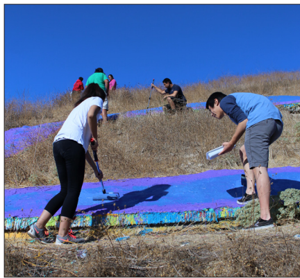
Painting the CPP letters