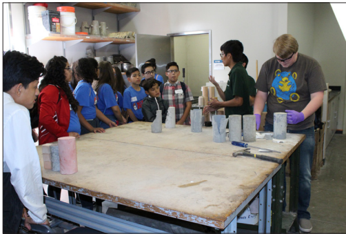
Students taking a tour of CPP's concrete lab

The Annual Civil Day event aims to teach middle school students about Civil Engineering as a profession. Here, we go over the different branches of Civil Engineering. We briefly cover the difference between Structural, Transportation, Geospatial, Geotechnical and Environmental engineering. Since the environmental aspect of civil engineering is not as commonly spoken about we emphasize the duties and responsibilities of an environmental engineer.